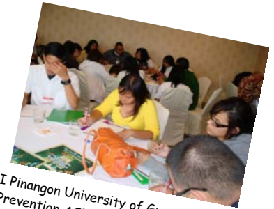
I Pinangon University of Guam Campus Suicide Prevention ASIST Trainees participate in the Memory Tree activity: September 5-6, 2009, University of Guam Humanities and Social Science Building

LifeWorks Guam networks with different agencies such as the University of Guam, IPinangon Campus Suicide Prevention Program, DMHSA-Prevention & Training Branch, Archdiocese of Agana, Department of Youth Affairs, Rainbows For All Children, among others.