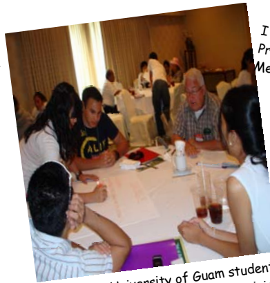
Americorps University of Guam students attending a workshop on Applied Suicide Intervention Skills Training (ASIST) at the Guam Marriott Hotel Resort & Spa on September 12-13, 2009.